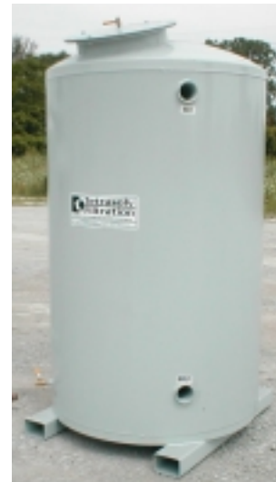
(Similar Vessel Pictured)